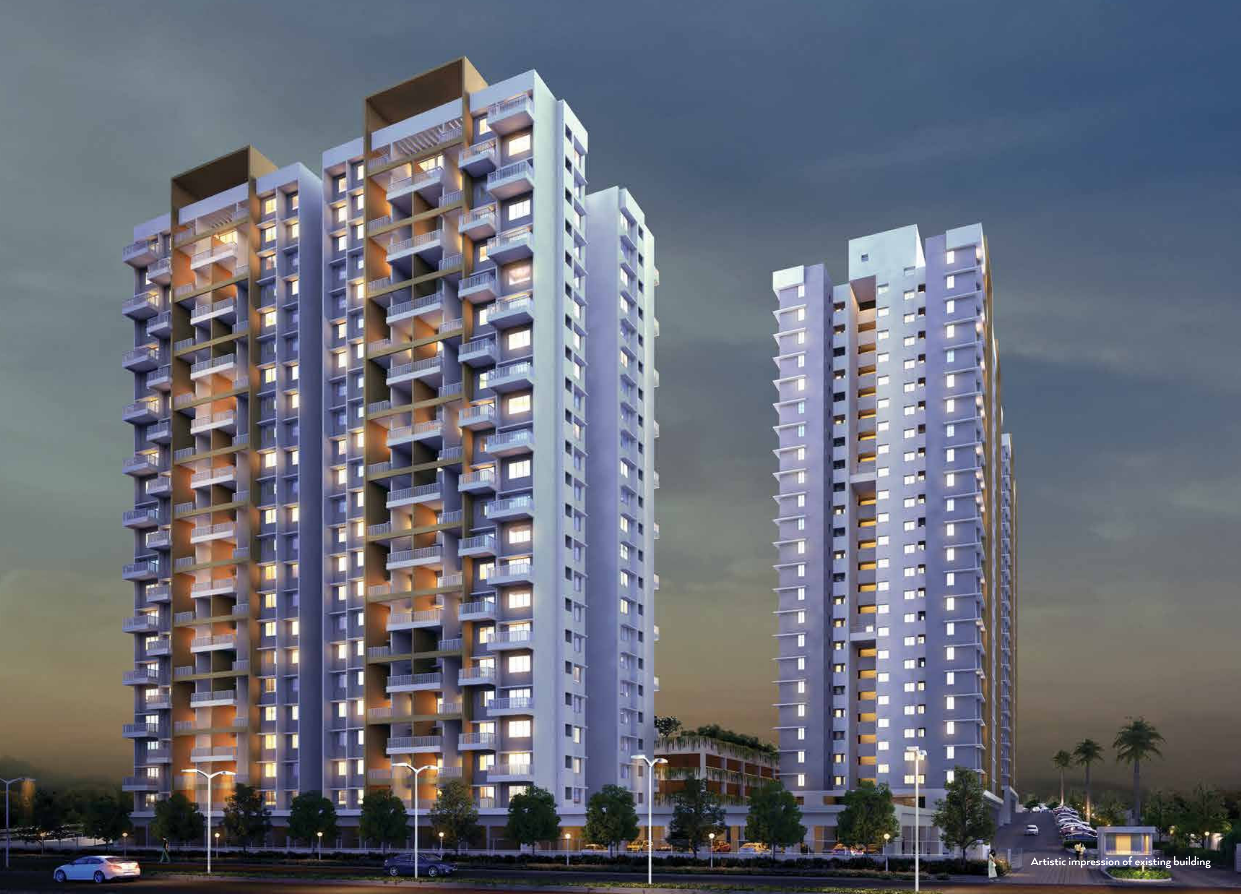
Artistic impression of existing building