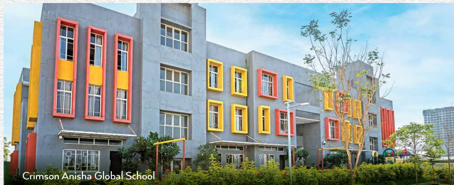
Crimson Anisha Global School