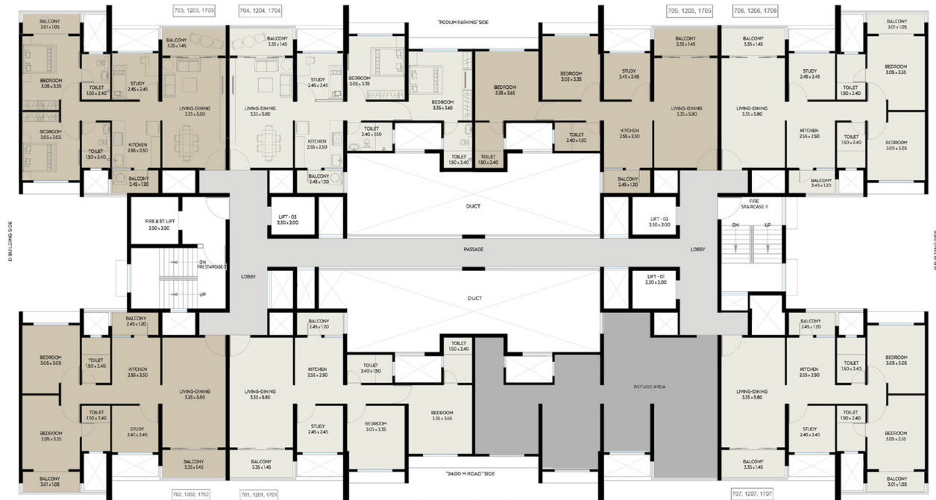
REFUGE FLOOR PLAN 7 th , 12 th , 17 th FLOOR